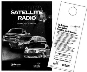
Mirror Hanger & Owner's Manual provided with your new system.