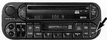
Premium Radio, Cassette and CD: RBP, RBU, RAZ