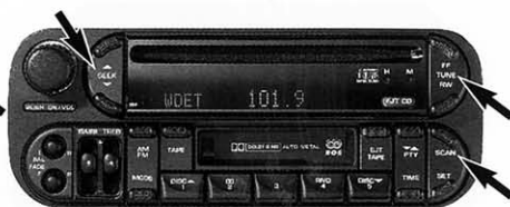
Premium Radio, Cassette and CD: RBP, RBU, RAZ