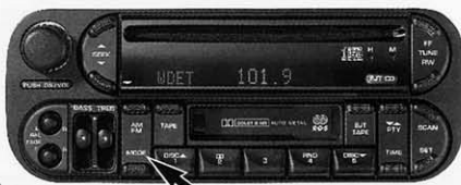
Premium Radio, Cassette and CD: RBP, RBU, RAZ