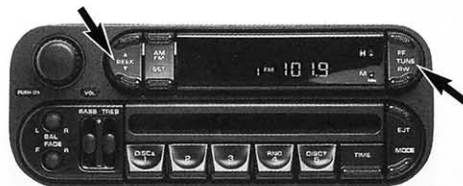
Single CD Radio: RBK