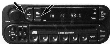
6-Disc CD Radio: RBQ