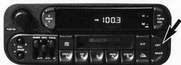
Single Cassette Radio: RBB