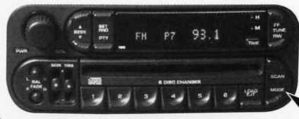
6-Disc CD Radio: RBQ