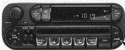
Single CD Radio: RBK