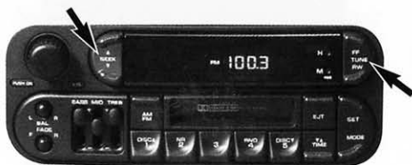
Single Cassette Radio: RBB