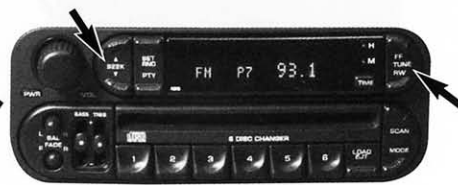
6-Disc CD Radio: RBQ