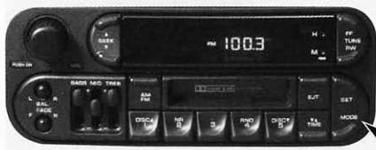
Single Cassette Radio: RBB