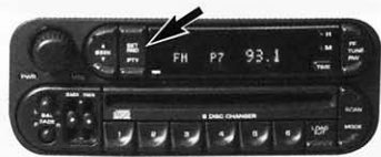
6-Disc CD Radio: RBQ