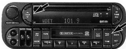
Premium Radio, Cassette and CD: RBP, RBU, RAZ